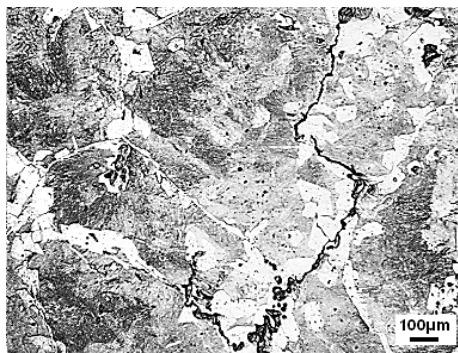
Fig. 3. The microstructure consists of ferrite, pearlite and some bainite. Micro- and macro cracks observed under optical microscope. 4% natal

A wide variety of degradation processes are possible to discover with the use of replica metallography.